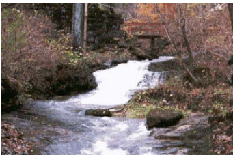
Muscatatuck River at the Vinegar Mill